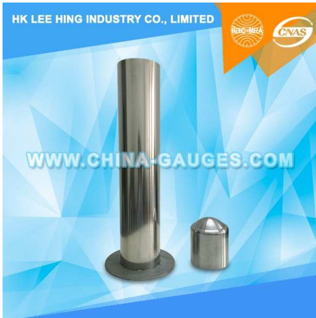
IEC 60068-2-75 Figure A.3 5J Striking Element with Catheter

According to IEC60068-2-75 table 1, table 2 and Figure A.3.